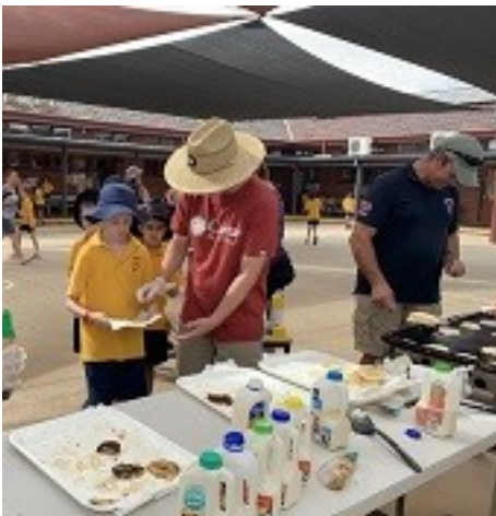
Enjoying pancakes on Shrove Tuesday!