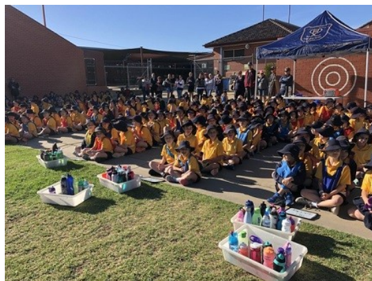
Having fun at Athletics Day