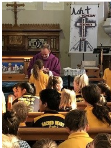
Ash Wednesday Mass